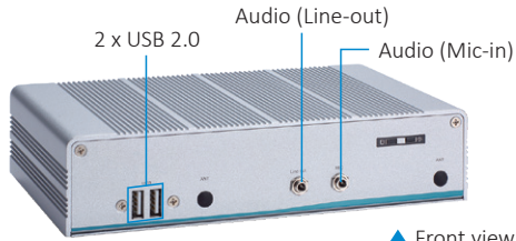
▲ Front view

Fanless Embedded System with Intel Atom® x5-E3940 1.8 GHz, HDMI, VGA, 2 GbE LAN, 6 USB, and 3 COM