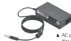
▲ AC power adapter (for GOT5120T-834-XGA-J)