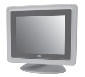
▲ Deskton stand